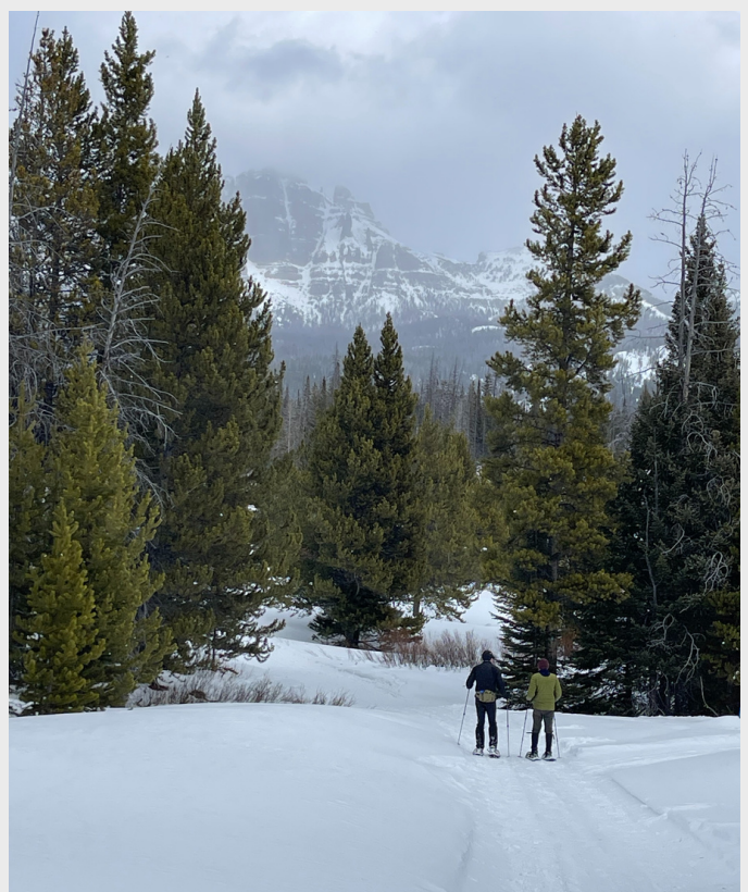
Photo of Deception Creek above Dubois