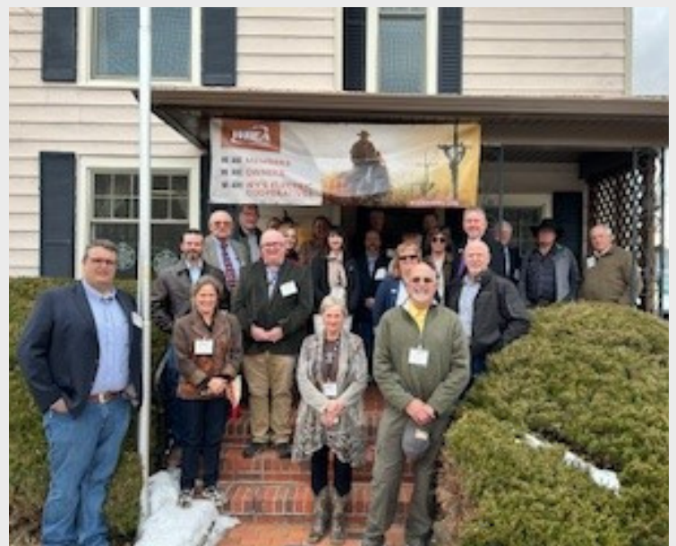
WREA Board members spend the day at the capitol

At High Plains Power, we believe that one of the best ways we can support our members and our communities is by participating in the legislative process and interacting with lawmakers to ensure that our members continue to have input in maintaining safe, reliable and affordable power.