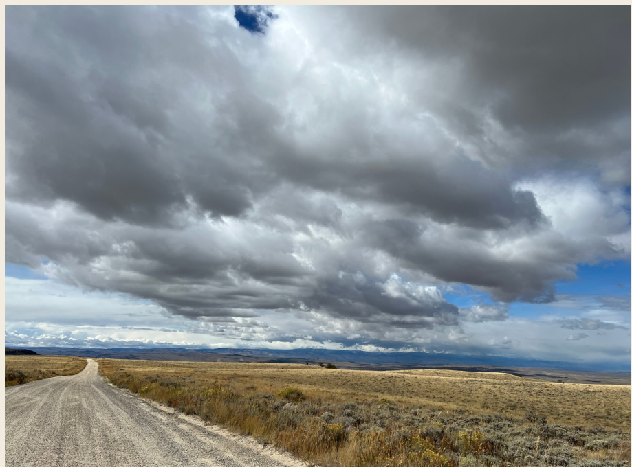
taken at the top of Beaver Rim.