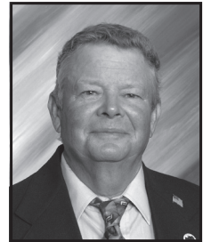
District 8 Hearley Dockham