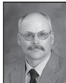
District 11 Mark Park