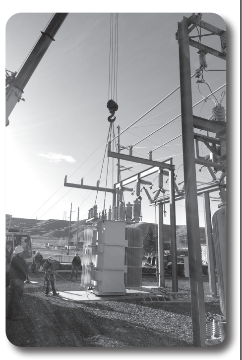
A 10-megavolt amp (MVA) transformer was purchased and replaced an existing 5 MVA transformer at the Henthorne sub.