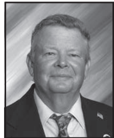
District 8 Hearley Dockham